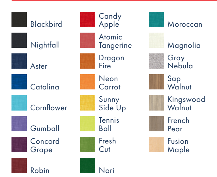
Table and Laminate Desk orders meeting minimum volume quantities have the option of any standard WilsonArt Laminate finish