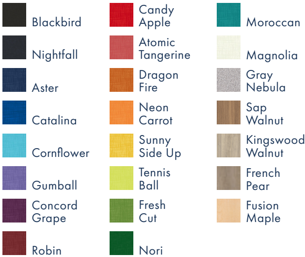
Table and Laminate Desk orders meeting minimum volume quantities have the option of any standard WilsonArt Laminate finish