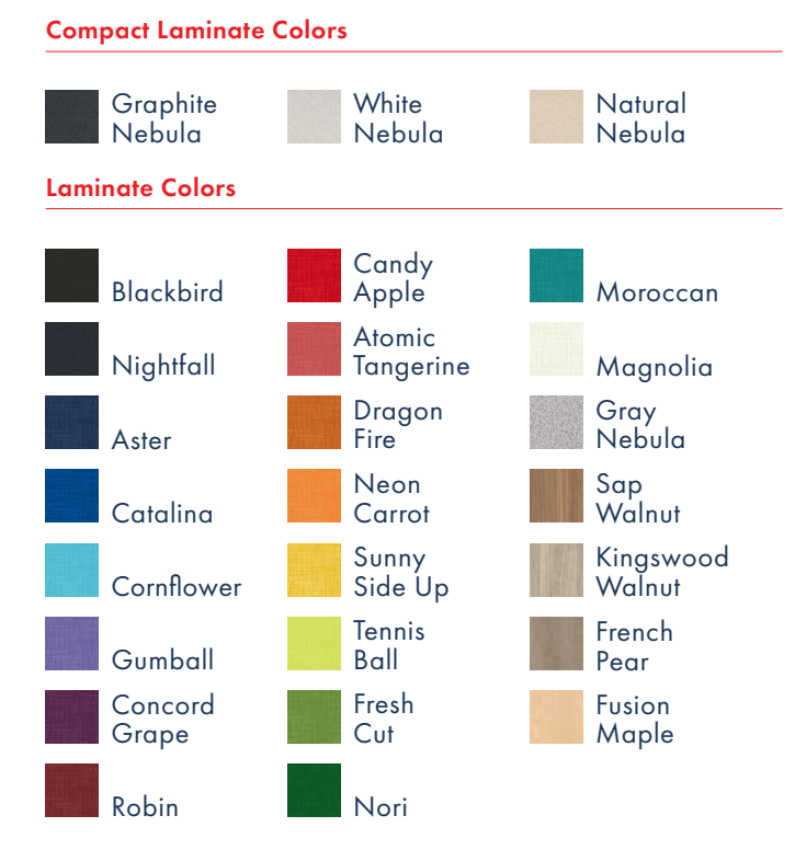
Table and Laminate Desk orders meeting minimum volume quantities have the option of any standard WilsonArt Laminate finish