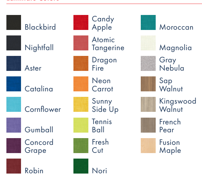
Table and Laminate Desk orders meeting minimum volume quantities have the option of any standard WilsonArt Laminate finish