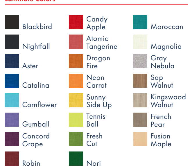
Table and Laminate Desk orders meeting minimum volume quantities have the option of any standard WilsonArt Laminate finish